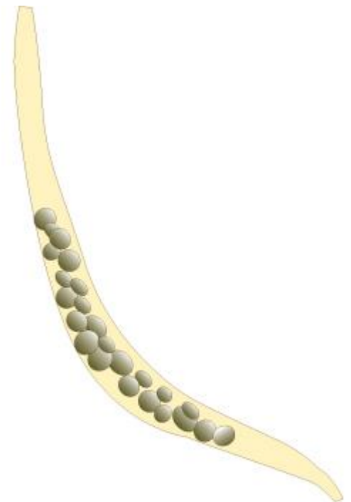
Magnified picture of Hookworm - actual size 1/8 inch